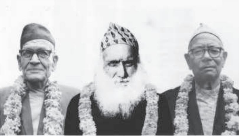
Suryabikram Gyawali, Dharnidhar Sharma & Parasmani Pradhan (Su-Dha-Pa) Founders of Nepali Sahitya Sammelan, Darjeeling