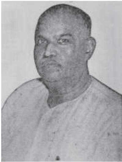
Dr. Shyama Prasad Mukherjee Vice Chancellor Calcutta University