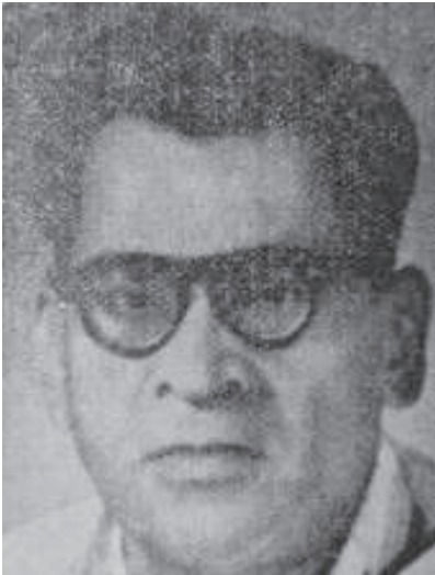
Dr. Suniti Kumar Chatterjee